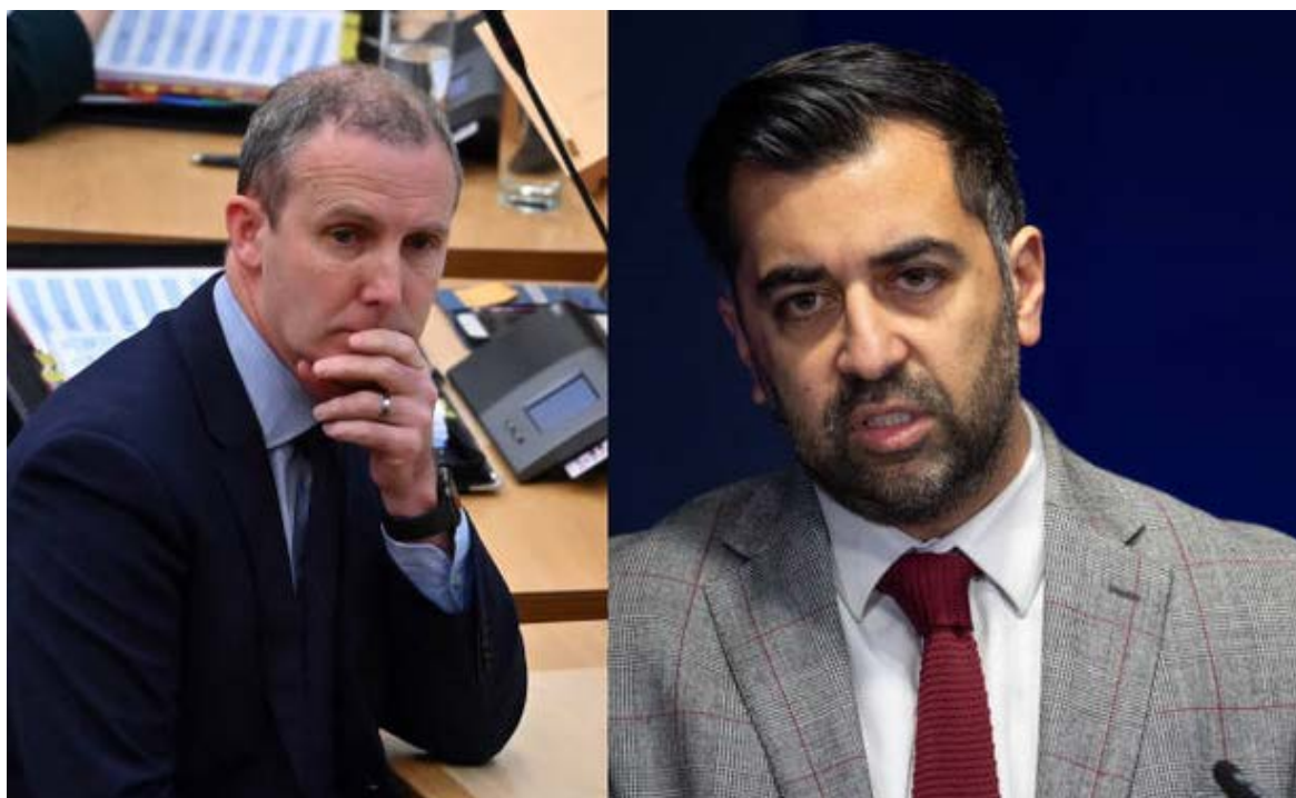
Michael Matheson and Humza Yousaf